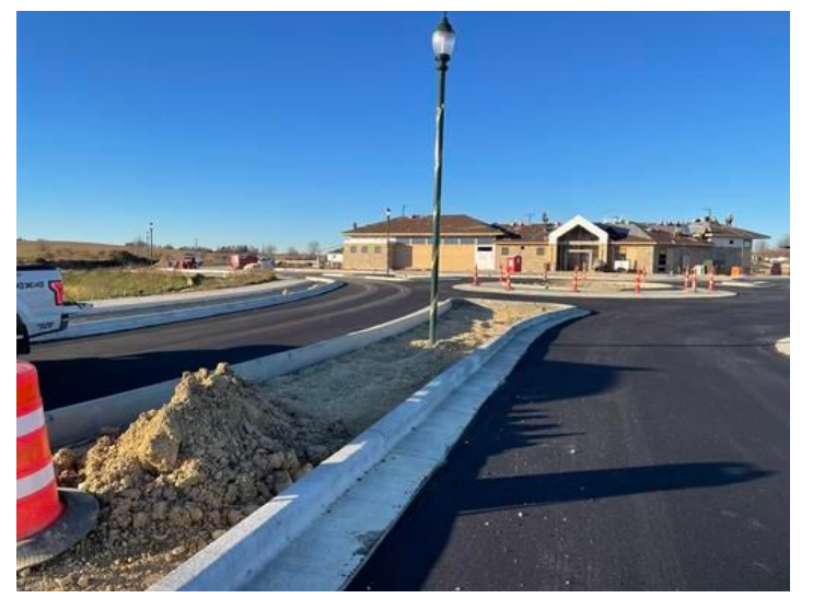
ready for Top soil. Taken on Nov 17, 2023, 3:14 PM CST Added on Nov 17, 2023, 3:43 PM CST Added by andrew gordon