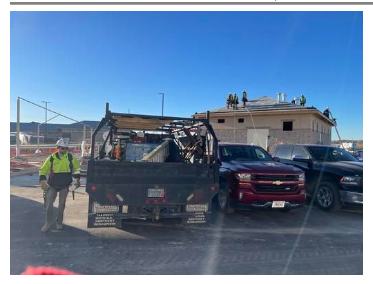
Roof installation at Pump House Taken on Nov 17, 2023, 8:27 AM CST Added on Nov 18, 2023, 9:37 AM CST Added by andrew gordon