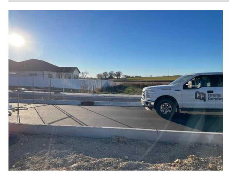
Installation of Binder Taken on Nov 17, 2023, 3:14 PM CST Added on Nov 17, 2023, 3:32 PM CST