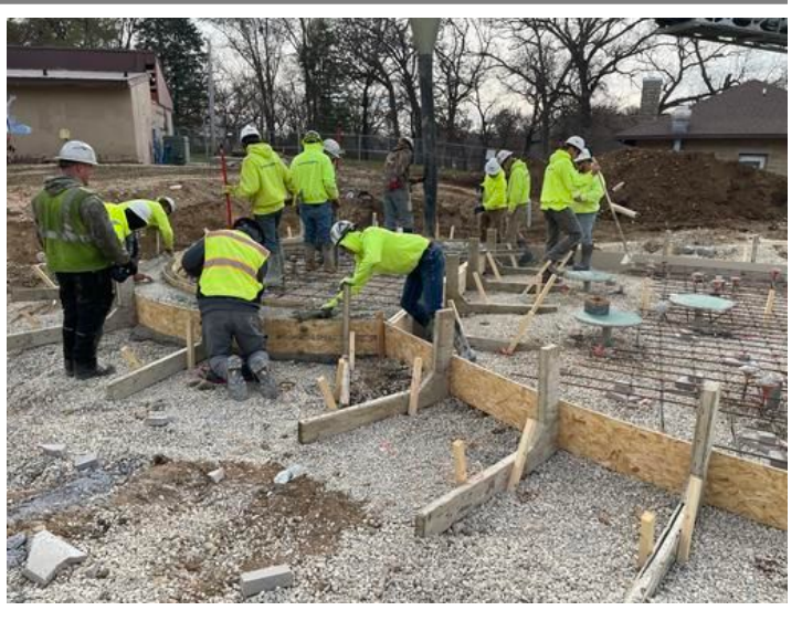
Installation of Splash Pad concrete Taken on Nov 16, 2023, 10:16 AM CST Added on Nov 16, 2023, 12:29 PM CST Added by andrew gordon