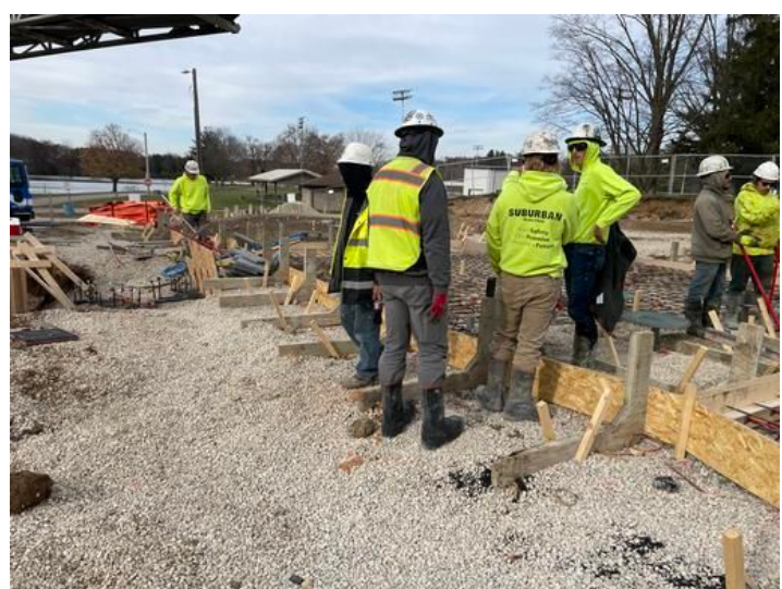
Prepare for Splash Pad concrete pour. Taken on Nov 16, 2023, 10:12 AM CST Added on Nov 16, 2023, 12:24 PM CST