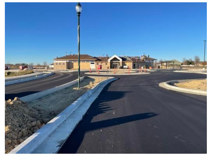
Installation of curbs Taken on Nov 17, 2023, 3:14 PM CST Added on Nov 17, 2023, 3:43 PM CST Added by andrew gordon