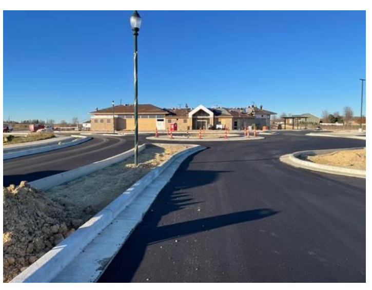
Installation of Bath House Roof. Taken on Nov 17, 2023, 3:14 PM CST Added on Nov 17, 2023, 3:43 PM CST Added by andrew gordon