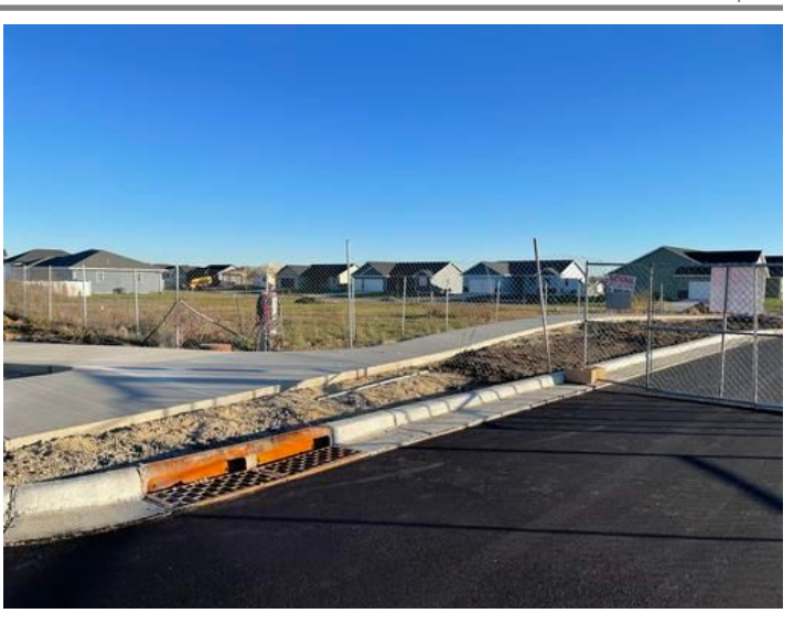
installation of Sidewalks Taken on Nov 17, 2023, 3:14 PM CST Added on Nov 17, 2023, 3:43 PM CST Added by andrew gordon